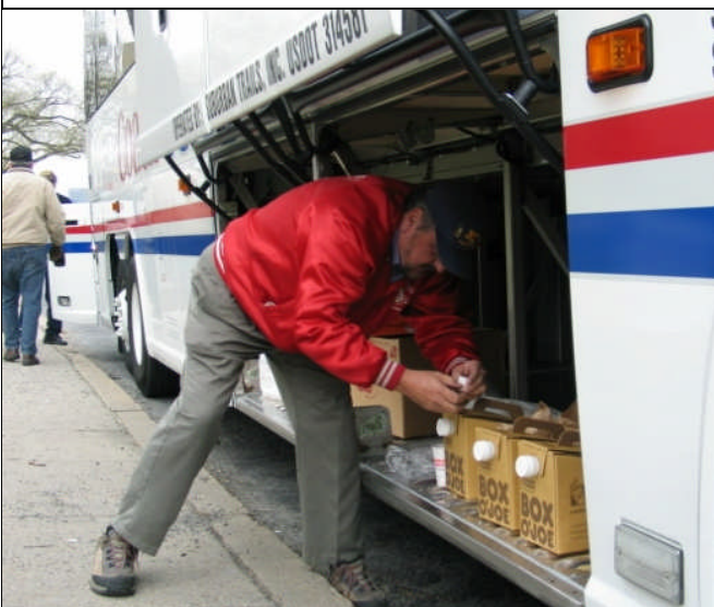
Chapter provided hot coffee and donuts for the visiting veterans to The Wall.

Chapter members are strongly encouraged to share in the next visit to The Wall by contacting Bruce at 703-323-0269. The next date has not yet been confirmed.