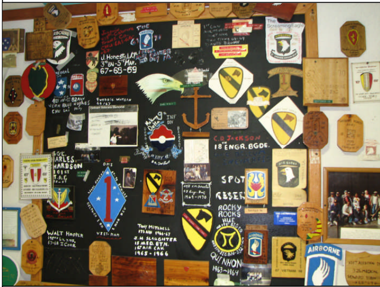
PTSD CLASS PLAQUES AT THE LYONS VAMC.