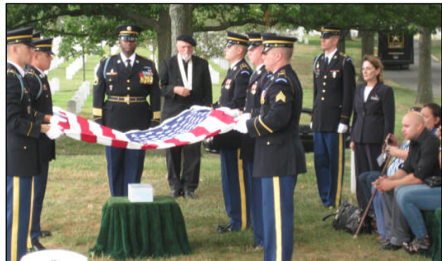
Chapter members attended the funeral of a Vietnam War veteran in response to his daughter's appeal since no family members were attending. The chapter paid for lodging and meals and provided transportation to the funeral at Arlington National Cemetery.

WHAT CAN YOU DO TO MAKE 2012 A BETTER YEAR?