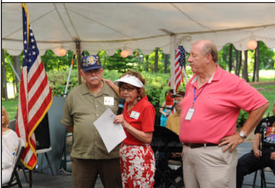
A new veteran assistance relationship was established with Elks Lodge 2188 of Fairfax. The lodge held a barbecue fundraiser to help homeless veterans and needy military personnel.