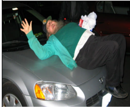
Will Charlie ride the hood for 2012?