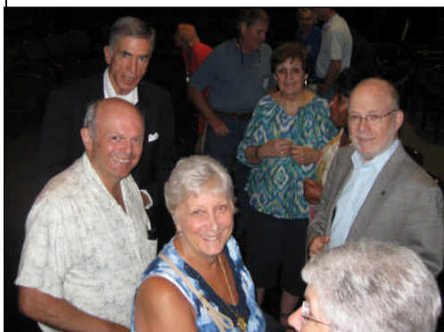
Members and Chuck Robb, Vietnam veteran and former U.S. Senator, discuss the play at the special post-show actor panel.

DD-214: Mail a copy of your DD-214 to the chapter's post office box address as shown on the newsletter. The social security number can be made illegible. This request is to comply with IRS audit requirements.