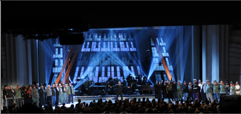
Kennedy Center Honors show features a tribute to Billy Joel.