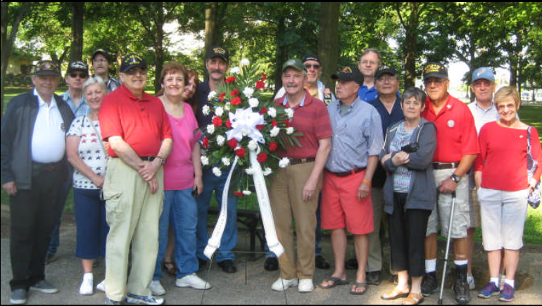
Members and guests fall-in to start our Memorial Day Service at The Wall on Memorial Day morning.