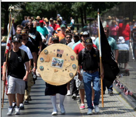
Lyons PTSD Class with their memorial plaque march to The Wall.

Our website has been instrumental in recruiting new members over the years. One member, who moved to Virginia, elected to transfer to the chapter despite having several Virginia chapters nearer to his home. When he was offered the opportunity to transfer to a closer chapter, he replied that he wanted to belong to an active chapter, which our website demonstrated that we are. He is now a chapter member for several years.