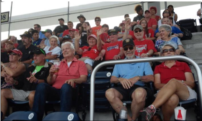
Members cheer on the Nationals, as our game winning attendance streak is alive and well.