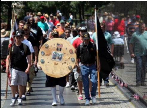
Lyons PTSD Class with their memorial plaque march to The Wall.